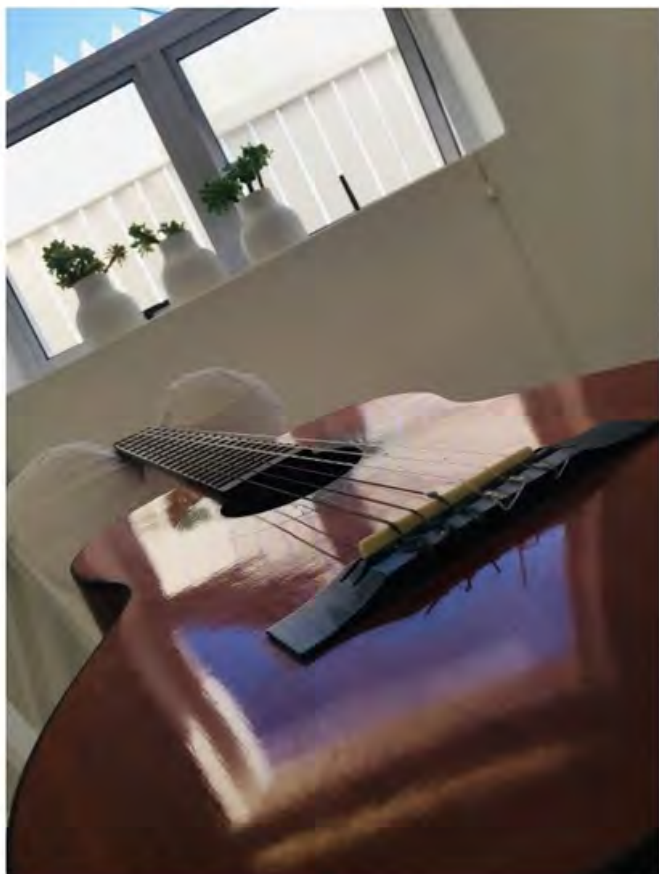
Ntsika Sesman - Gr 10