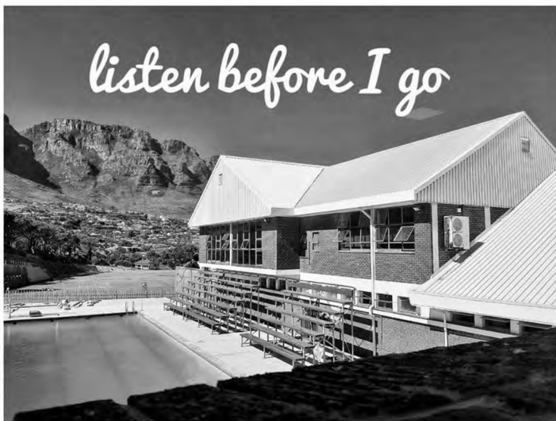
Zizipho Ndayi - Gr 10