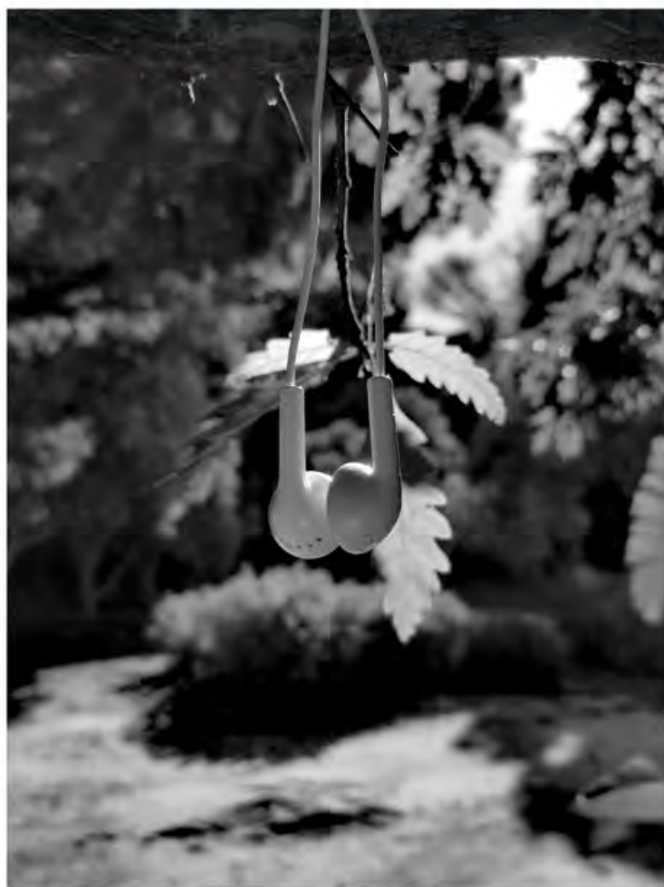
Luna Viljoen Ventura - Gr 11