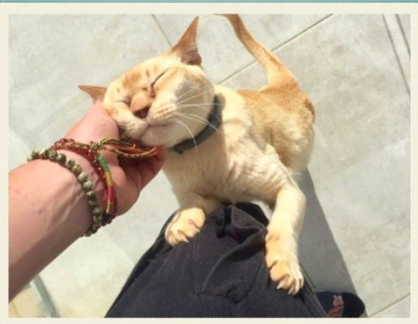
Luca Samassa with Tigger